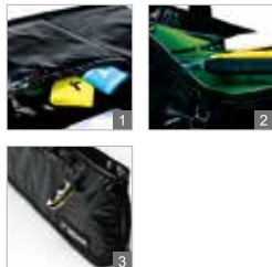
1. FUNCTIONAL FRONT POUCH 2. RACKET COMPARTMENT 3. BUCKLES (ACCESSORY IS NOT INCLUDED)