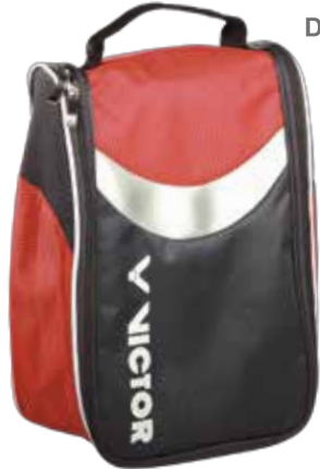
BG619 C/D Shoes Bag