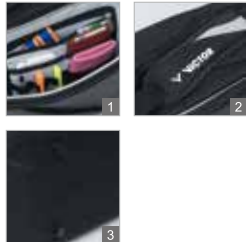
1. FUNCTIONAL FRONT POUCH 2. REMOVABLE SINGLE STRAP 3. STUDS ON BOTTOM