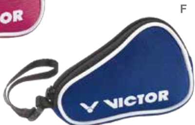
P-0009 C/Q/F Coin Purses