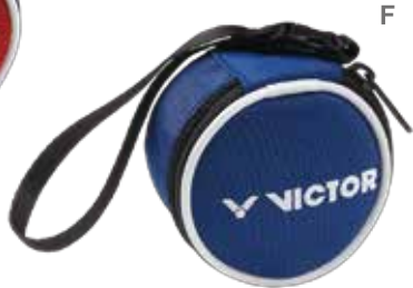
P-0008 C/D/F Coin Purses